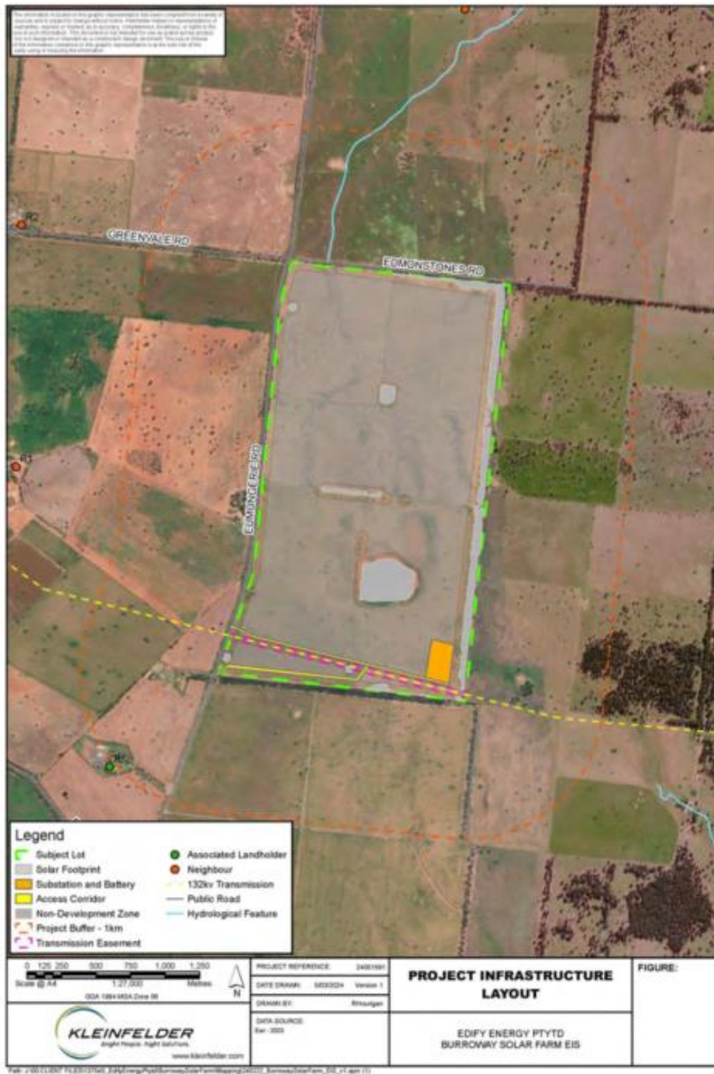
Figure 1-1: Project Site Preliminary Layout including Existing Infrastructure and Non-development Zones